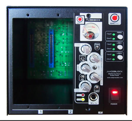
Optional SM Pro Audio power supply