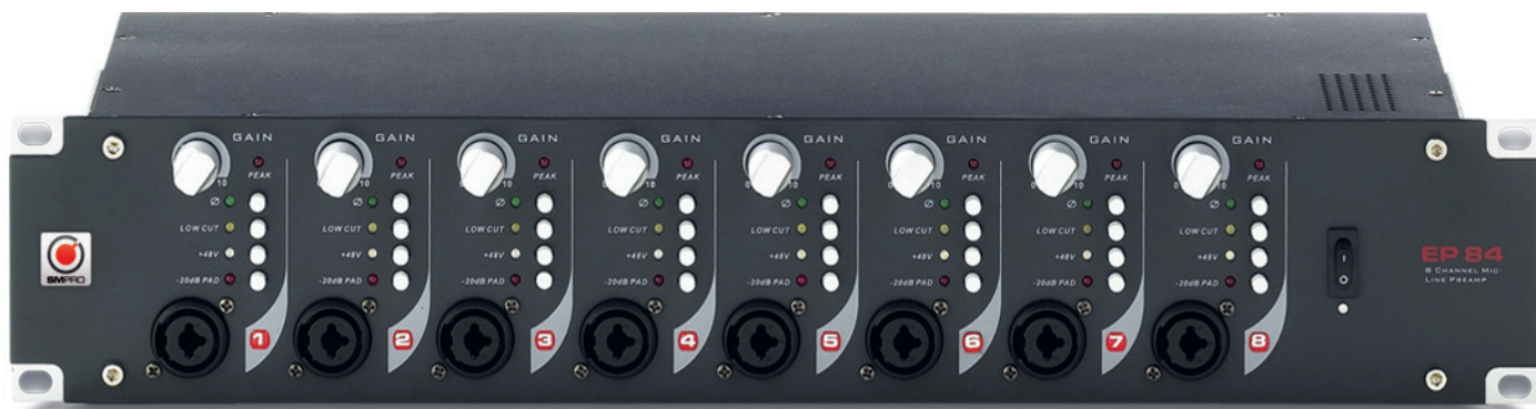
EP84 front panel

* Note: Please take into consideration ventilation of your equipment. A well-ventilated equipment rack will ensure optimum operation and longevity of your equipment. It's often a good idea to leave 1 free rack-bay position between your equipment to allow ventilation. As to avoid overheating, please do not place the EP84 on high temperature devices such as power amplifiers.