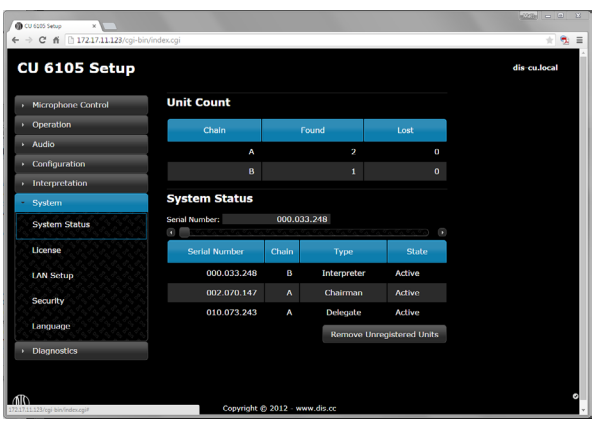
Setup and Configuration