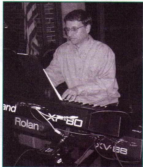
Goomas' winning combo—the XV-88, XP-80 and two KC-500 amplifiers (one on each side)

SG: I improvise a lot and that's what I stress in teaching with Maranatha—just bringing keyboard players into an improvisational state. It doesn't mean getting heavy or filling up the song until it's obnoxious, but even just real simple parts... you know, thinking like an orchestrator instead of a keyboard player. And that's the cool thing about having all those [expansion] cards and sounds—there's just so many to choose from that on different songs you can get a different color and different flavor.