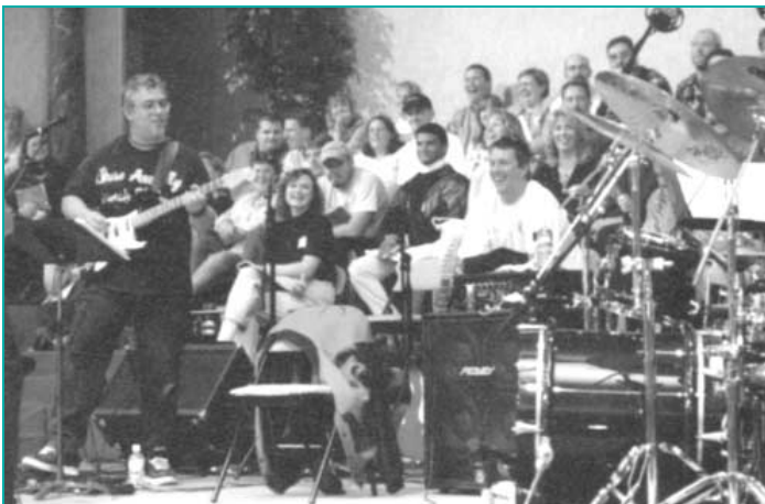
Bridgens teaching a WLW guitar class using the GT-3.

DB: Well, I don't use an amp at all because our church room is very live. This is where the GT-3's ability to simulate preamp settings is really amazing. The fact that you can simulate different speaker enclosures and microphone positions on the enclosure is a huge thing for me. Without that, I would not be able to do what I'm doing.