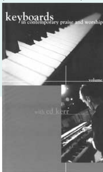
an instructional video

contacted directly via email at ed@kerrtunes.com .