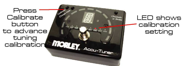
Diagram #4 Calibrate