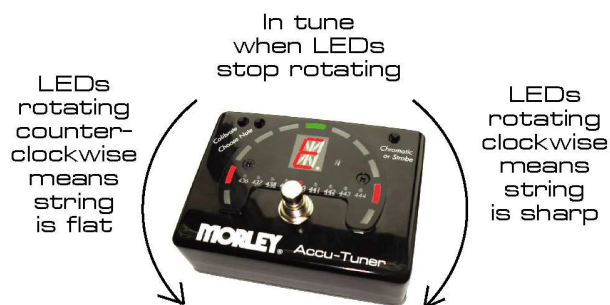
Diagram #2 Strobe Mode Tuning