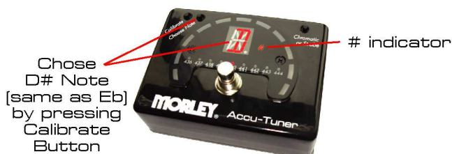
Diagram #3 Choose Note