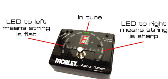
Diagram #1 Chromatic Mode Tuning

STROBE MODE TUNING: Again, pluck a string and let ring. In strobe mode, the LEDs rotate indicating flat (LEDs rotating counter-clockwise), sharp (LEDs rotating clockwise) or in tune (LEDs stop rotating and stay still). See diagram #2.