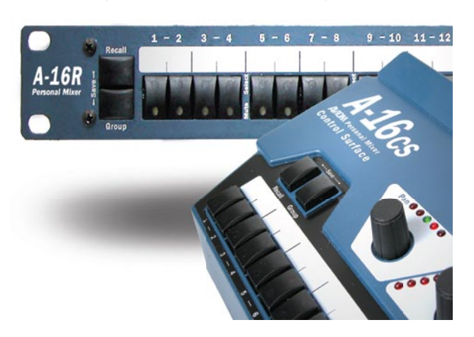
The A-16R Personal Mixer offers simplified connections to wireless in-ear style monitor systems. The optional A-16CS gives a performer remote control over the mix functions.

All Personal Mixing and wireless in-ear systems consist of an Aviom Personal Mixer connected to a transmitter for the wireless in-ears. That transmitter sends the mix (made at the Personal Mixer) wirelessly to a beltpack receiver worn by the performer. The earbuds themselves are plugged in to the beltpack. How you connect the transmitter to the Personal Mixer is dictated by which Aviom Personal Mixer you use.