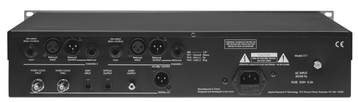
ART Digital MPA – Rear view image (above)